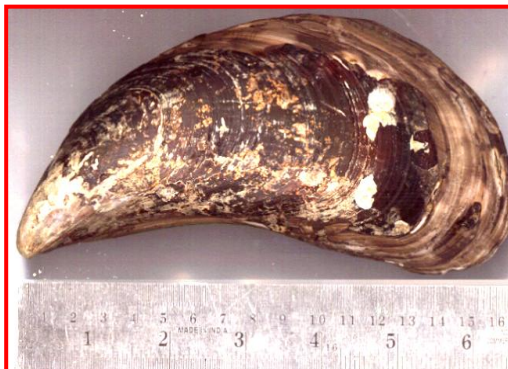
Figure-5 Mytilus shell showing growth rings indicating the age of animal.