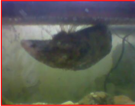
Figure-9 Mytilus seen hanging on a floating wooden piece by means of byssus in an aquarium.