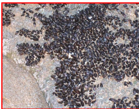
Figure-2 Colony of juvenile Mytilus (spat size 8mm) at Mocha