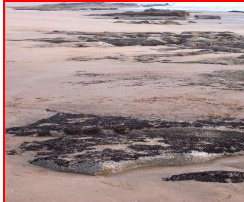
Figure-4 Colonies of numerous spat away from the shore (Mocha).