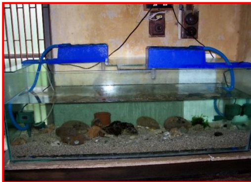
Figure-7 Aquarium containing Mytilus in laboratory.