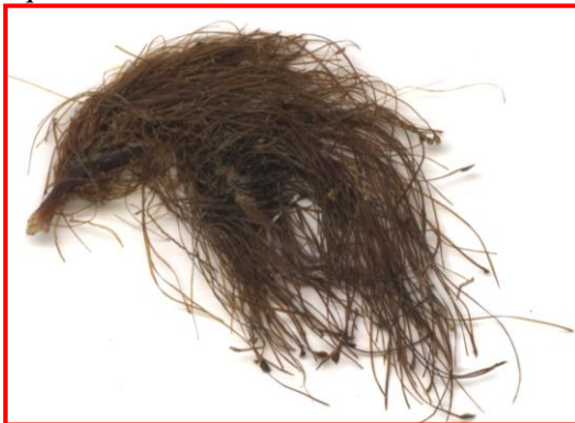
Figure-11 Bunch of byssus showing broomstick appearance. 1- Stem, 2- Thread proper, 3- Plaque.