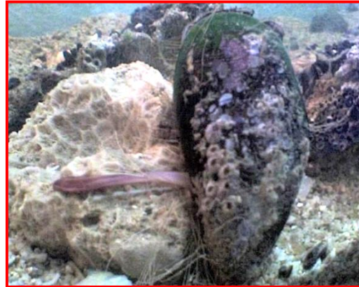
Figure-10 Mytilus with foot extended to produce byssus in laboratory aquarium.