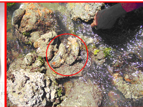
Figure-6 Mytilus covered with orange colored material at Dwarka.