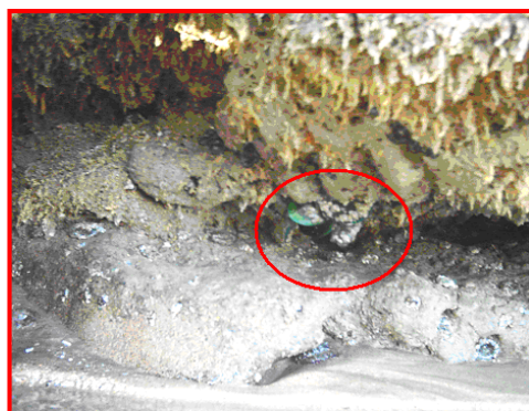
Figure-1 Colony of Mytilus at Mocha showing few animals