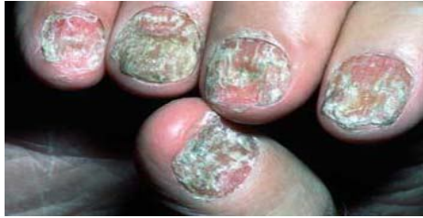
Fig: Proximal subungual onychomycosis.

The pattern of growth in PSO is from the proximal nail fold on the lunula area distally to involve all layers of the nail. Although PSO is the most infrequently occurring form of onychomycosis in the general population, it is common in AIDS patients and is considered an early clinical marker of HIV infection. (In one study of 62 patients with AIDS or AIDS-related complex and onychomycosis, 54 patients (88.7%) had PSO, with T. rubrum being the etiologic agent in more than half of these patients. In 54 patients, the feet were affected, and in 5 patients, the hands were infected; infections of both toenails and fingernails were present in 3 patients 6 . Infection may also occasionally arise secondary to trauma.