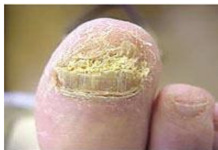
Fig: Distal subungual onychomycosis.

the Finnish study, only 2 of the 91 patients with dermatophyte-related onychomycosis of the toenails also had fingernail involvement. Toenail infections were approximately 20 times more common than fingernail infections in the Ohio cohort. The increased frequency of toenail in comparison to fingernail infections probably reflects the greater incidence of tinea pedis than of tinea manuum 5 .