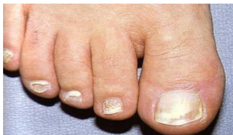
Fig: White superficial onychomycosis

White superficial onychomycosis (WSO) is less common than DSO (estimated proportion of onychomycosis cases, 10%) and occurs when certain fungi invade the superficial layers of the nail plate directly. (Later, the infection may move through the nail plate to infect the cornified layer of the nail bed and hyponychium.) It can be recognized by the presence of well-delineated opaque “white islands” on the external nail plate, which coalesce and spread as the disease progresses. At this point, the nail becomes rough, soft, and crumbly. Inflammation is usually minimal in patients with WSO, because viable tissue is not involved (WSO) occurs primarily in the toenails.